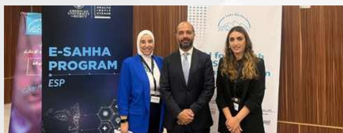
GHI Co-Organizes a Regional Event on Artificial Intelligence for Health Systems Transformation in Egypt alongside Partners and Key Stakeholders