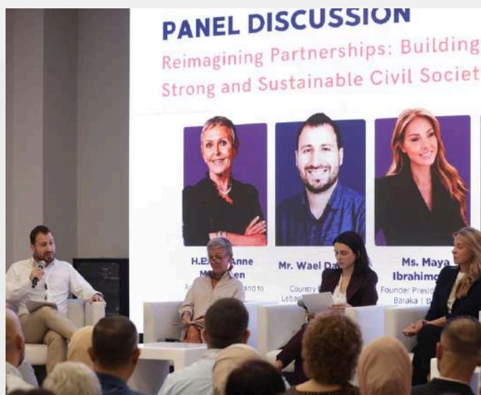
Over 150 NGOs Unite at NGOi Open House 2025 to Reimagine Partnerships and Drive Regional Impact