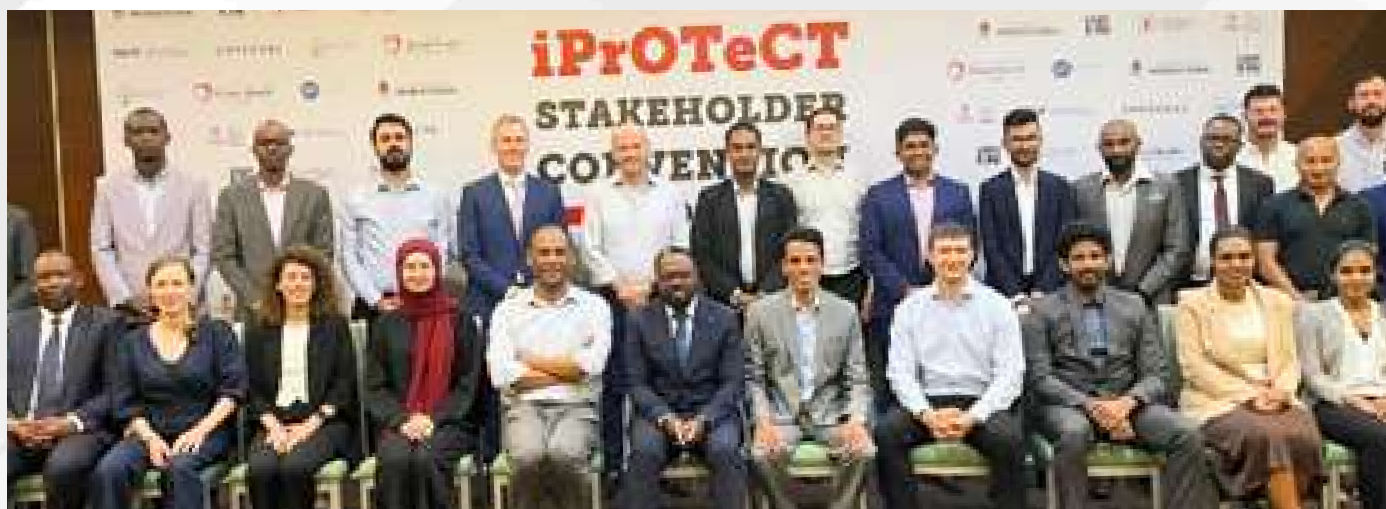
CMP Participates in iProTeCT Conference in Rwanda