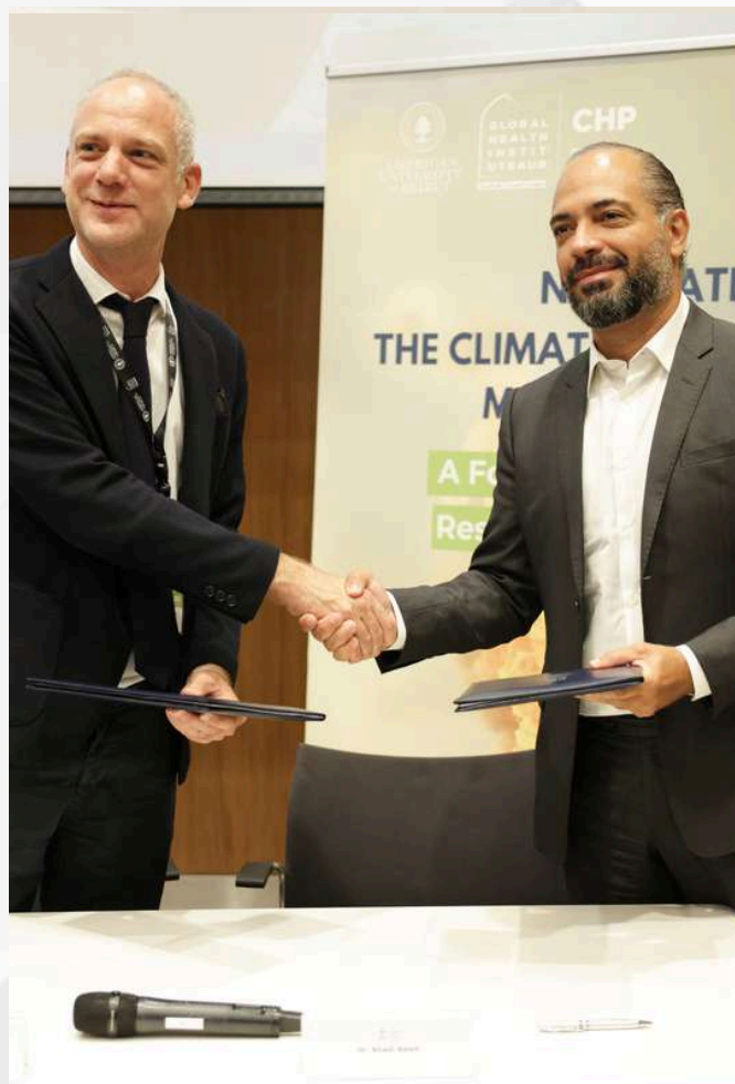
GHI signs a Memorandum of Understanding with IOM Regional Office for MENA in a Jointly Organized Forum on Climate Change, Health and Migration