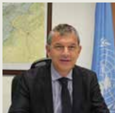
Philippe Lazzarini PhD, MPH Resident and Humanitarian Coordinator for Lebanon United Nations Lebanon